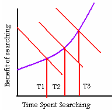
Fig. 2 Search and dispersion curve

Information asymmetries create situations where a better informed buyer gets the best value. For a specific example in the context of E-commerce; let's take the case of an actual price search for a specific model of a handy camera: Sony DCR-SR62. There are several websites that sell the exactly same product at different prices. A consumer, new to online purchasing may go to Amazon and buy the product for 499.99. A consumer who is more educated about internet searches is able to do a quick but detailed search through websites such as www.dealtime.com or www.pricegrabber.com or www.dgkala.ir (Iranian site). In this manner, she identifies the same product being sold at http://www.tristatecamera.com for a cost of 409.99 and total with shipping for 433.22. The total savings is $66.77. There is a significant gain due to the information asymmetry, this is price dispersion. Price dispersion implies that households and firms must spend time and energy in looking for the best value. Search is considered an important and costly economic activity. As it is costly it will stop before the consumer has all the information she needs and may result in poor bargains. As the opportunity cost of a search increases with each additional unit of time, the amount of search will be at the exact point where the marginal benefit equals the marginal cost. With an increase in the phenomenon of price dispersion (i.e. same good, different prices), the search amount increases [ 2].